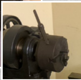
Fitted with 5" (127mm) diameter 3-jaw chuck