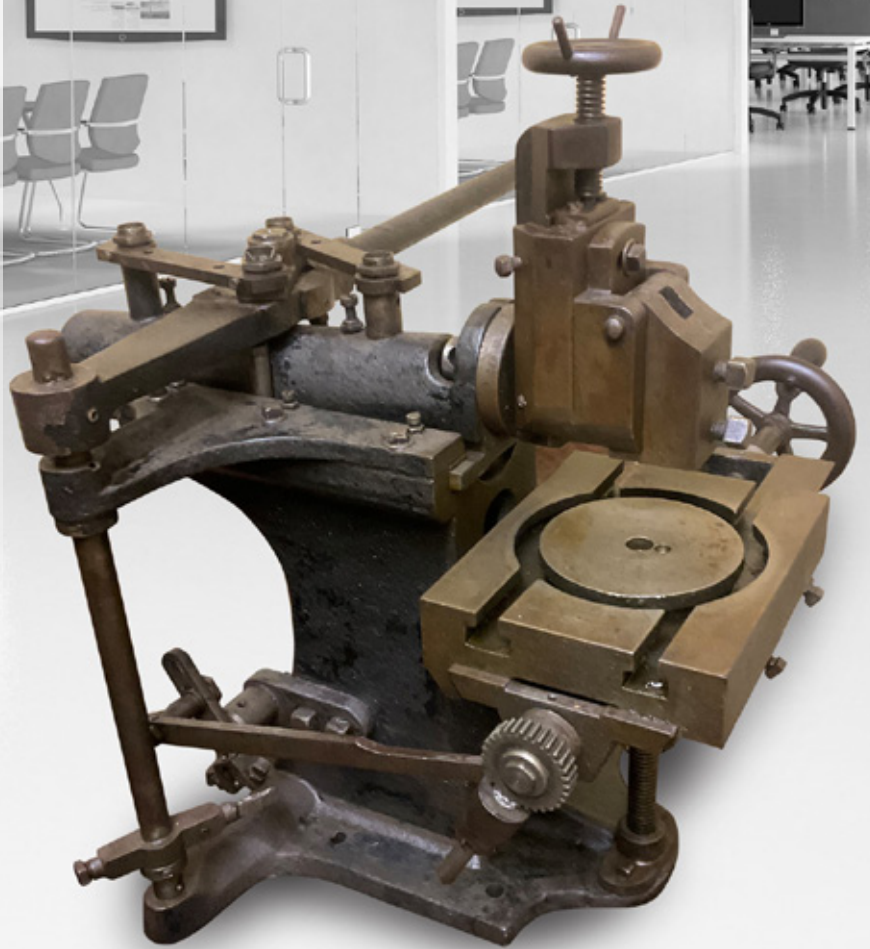
Table size 9" x 8" (229mm x 203mm) Cross traverse 7" (178mm) Vertical traverse 4 1/2" (114mm)

Vintage Drummond bench type hand operated metal shaper from early 1900's