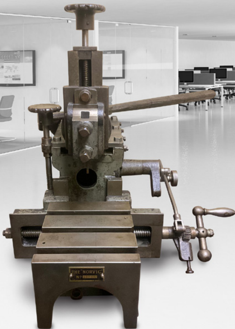
Table size 8" x 6" (203mm x 152mm) Ram stroke 11" (280mm) Cross traverse 9" (230mm) Distance from tool to table upto 6" (152mm)

Vintage 'The Norvic' made by Ormerod of Manchester hand operated metal shaper from 1920's to 1930's